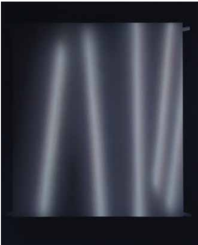
Put back, Dan 2 (painting), 2023 Acrylic on canvas, 80 x 100 cm