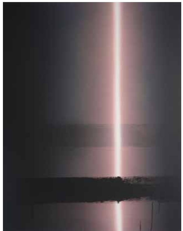
Dan évolution 7 (painting), 2023 Acrylic on canvas, 100 x 81 cm