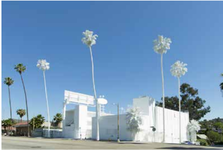
Projection (Sunset Pacific Motel) , 2015. 4311 W Sunset Boulevard, Los Angeles.