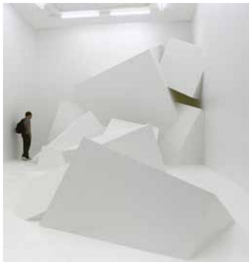
AR.07 , 2008. Institute of Contemporary Art, Villeurbanne.