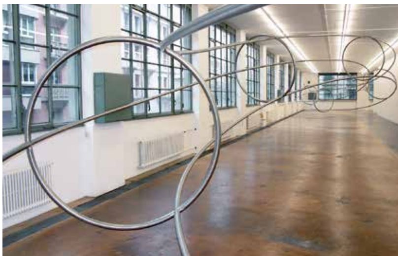
Scape , 2006. MAMCO, Geneva.