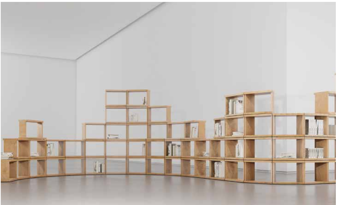
Orbis, 2023, layout suggestions.