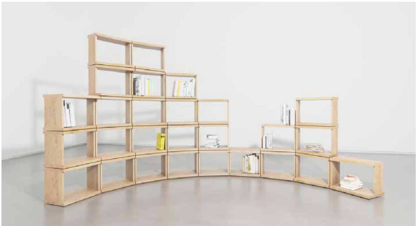
Orbis 4.2, 2023, 27 modules laid out.