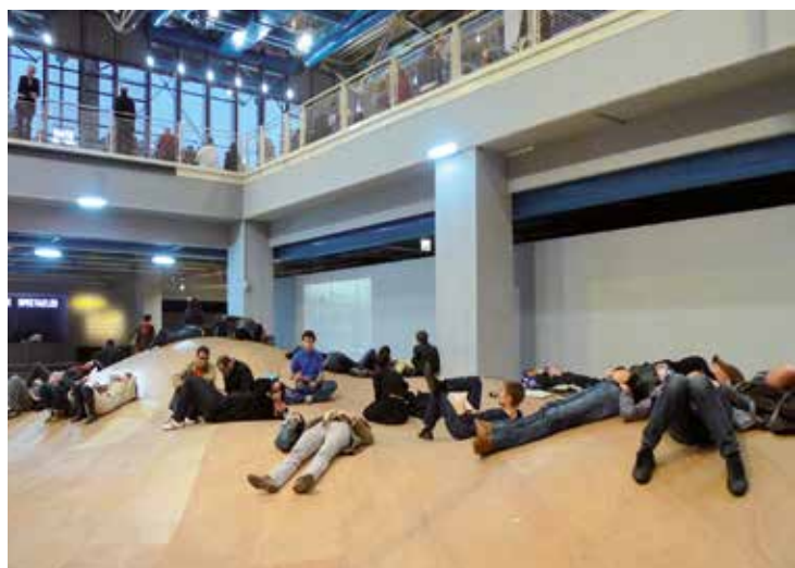
Sol.07 , 2009. Center Georges Pompidou, Paris.