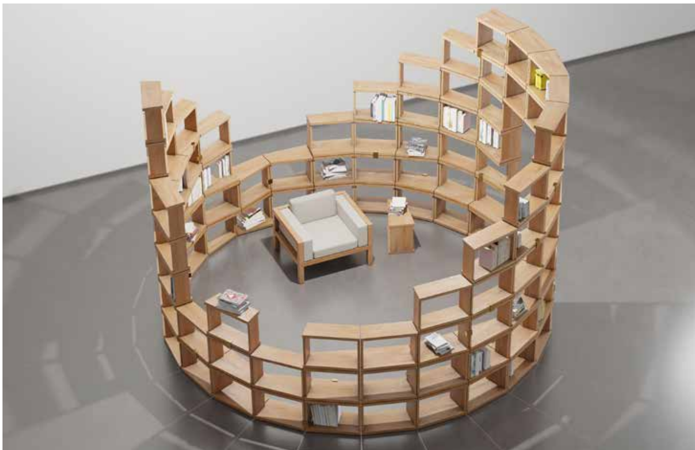
Orbis 4.2, 2023

Orbis 4.2 , 420 cm in diameter. The artist is offering a sculpture library with a minimum of 12 modules, to which additional modules can be added even after the purchase. A complete tower requires 168 modules (maximum height 319 cm).