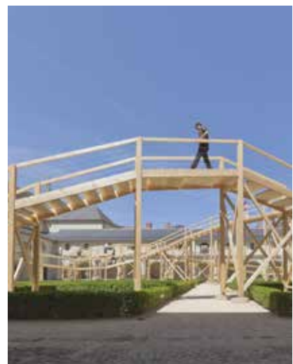
Belvedere(s) , 2012. The Royal Abbey of Fontevraud.