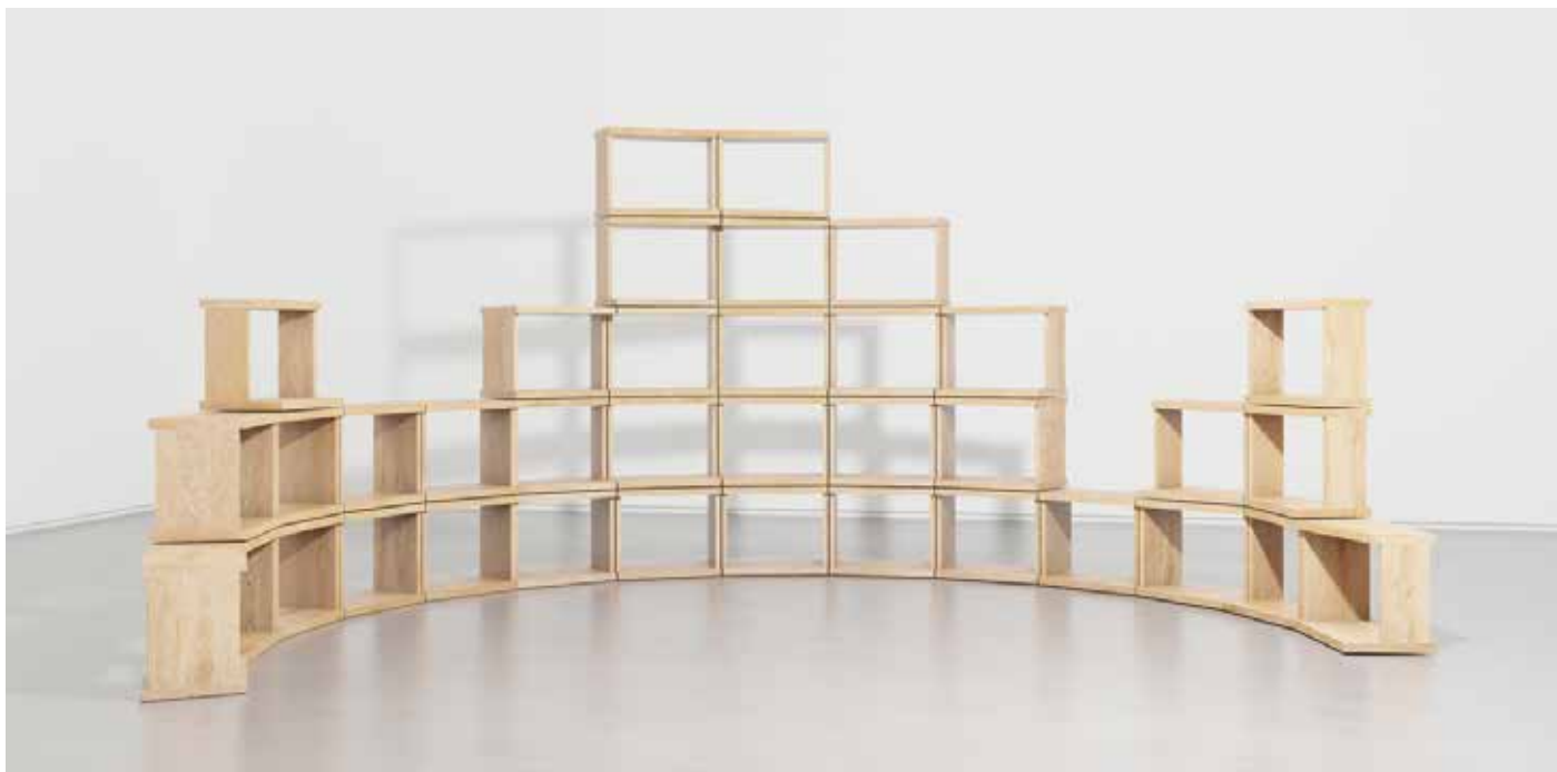
Orbis 4.2, 2023, 37 modules laid out.