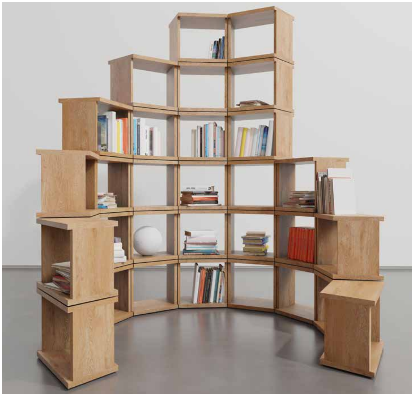
Orbis 2.1 , 2023

Orbis 2.1 , with a diameter of 210 cm. The artist proposes a library-sculpture with a minimum of 6 modules, to which additional modules can be added even after its purchase. A complete tower requires 60 modules (maximum height 319 cm).