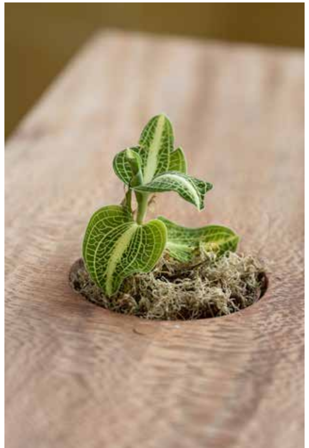
Installation view, LABO, Milano, Italy, 2023