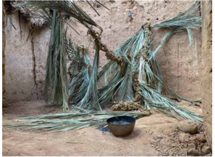
Exhibition view, The oasis reborn , AlUla, Saudi Arabia, 2022, © Malo Legrand