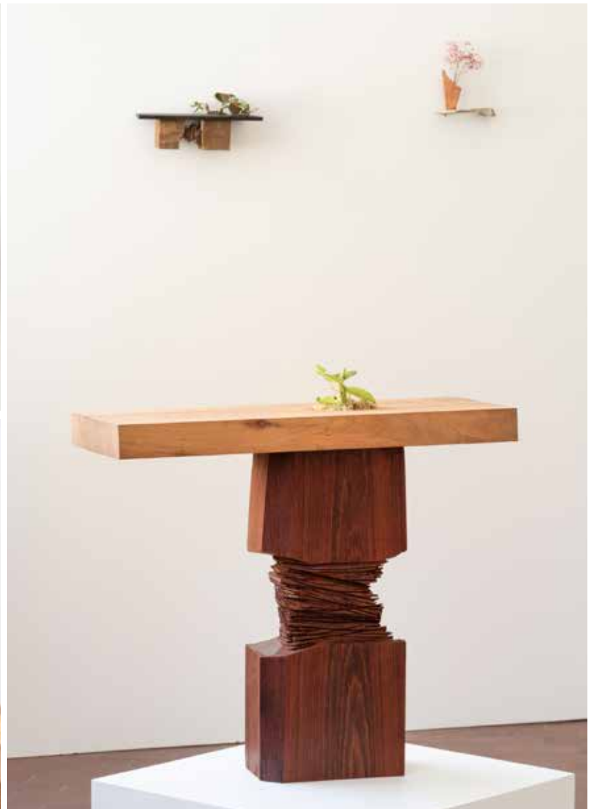
Installation view, LABÒ, Milano, Italy, 2023, © Lorenzo Palmieri