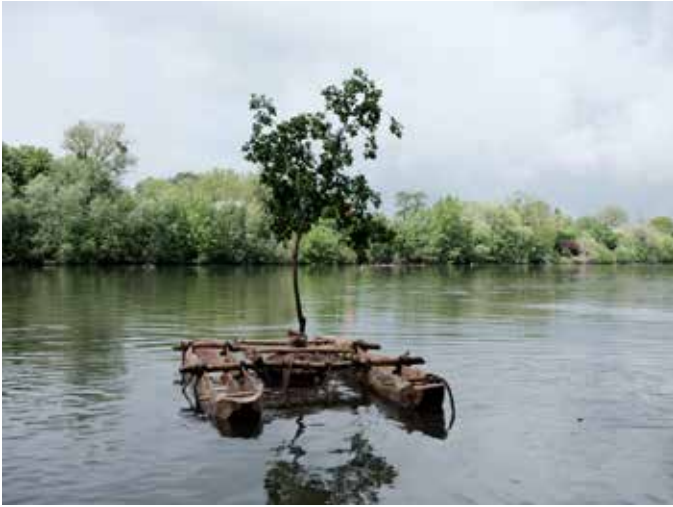
Installation view, Festival Sculptures en île , Andrésy, île Nancy, France, 2023