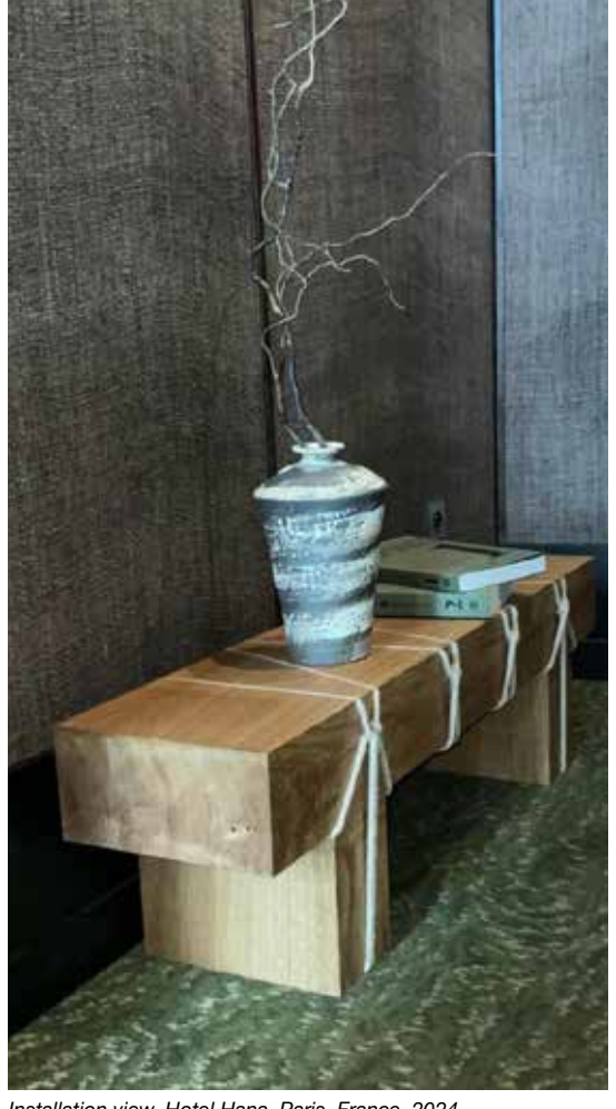
Installation view, Hotel Hana, Paris, France, 2024

Projects ColAAb Shibari bench (bench), 2022 Solid Burgundy oak, linen rope. H 35 x W 120 x D 28 cm H 13.8 x W 47.2 x D 11 in (custom made). Numbered, signed and limited edition: 8 pieces + 4 A.P. Price upon request.