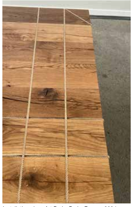
Installation view, Art Paris, Paris, France, 2024