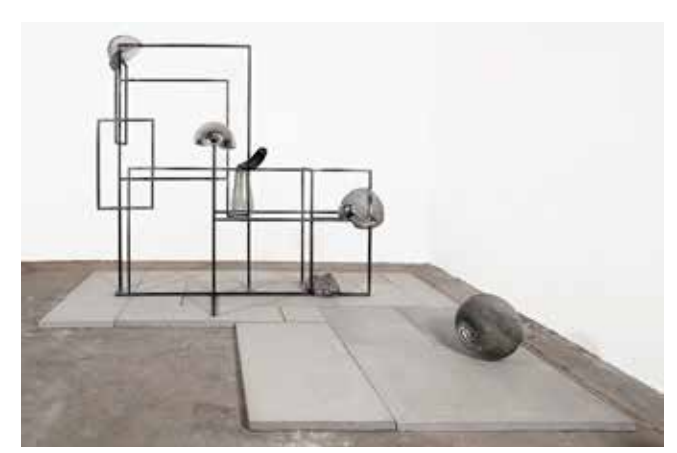
1. Exhibition view, Tracy Williams gallery, New york, USA, 2016