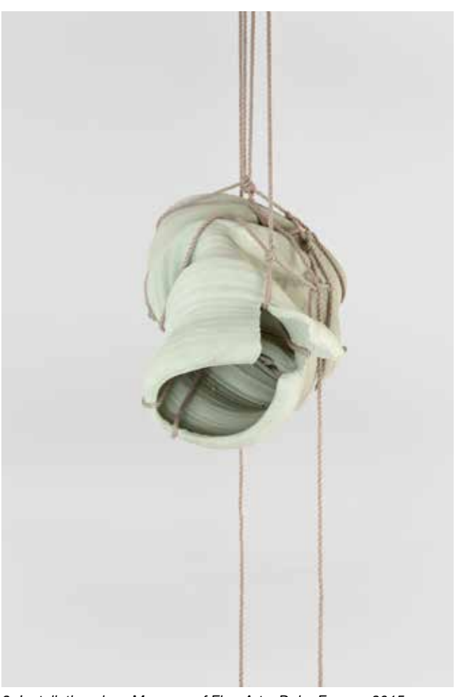
2. Installation view, Museum of Fine Arts, Dole, France, 2015