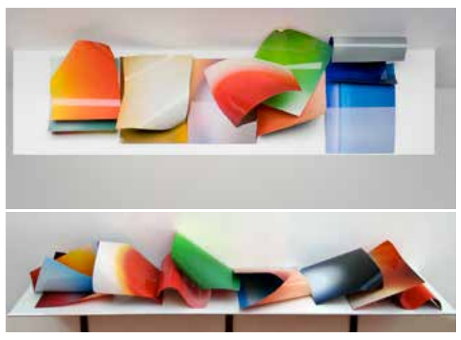
3. Installation view, Loevenbruck gallery, Paris, France, 2009