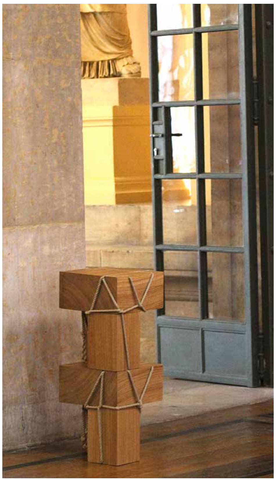
Installation view, Beaux-Arts de Paris, Paris, France, 2023, © Alice Randazzo

Projects ColAAb Shibari stool (stool), 2022 Solid Burgundy oak, linen rope. H 35 x W 28 x D 28 cm H 13,8 x W 11 x D 11 in (custom made). Numbered, signed and limited edition: 8 pieces + 4 A.P. Price upon request.