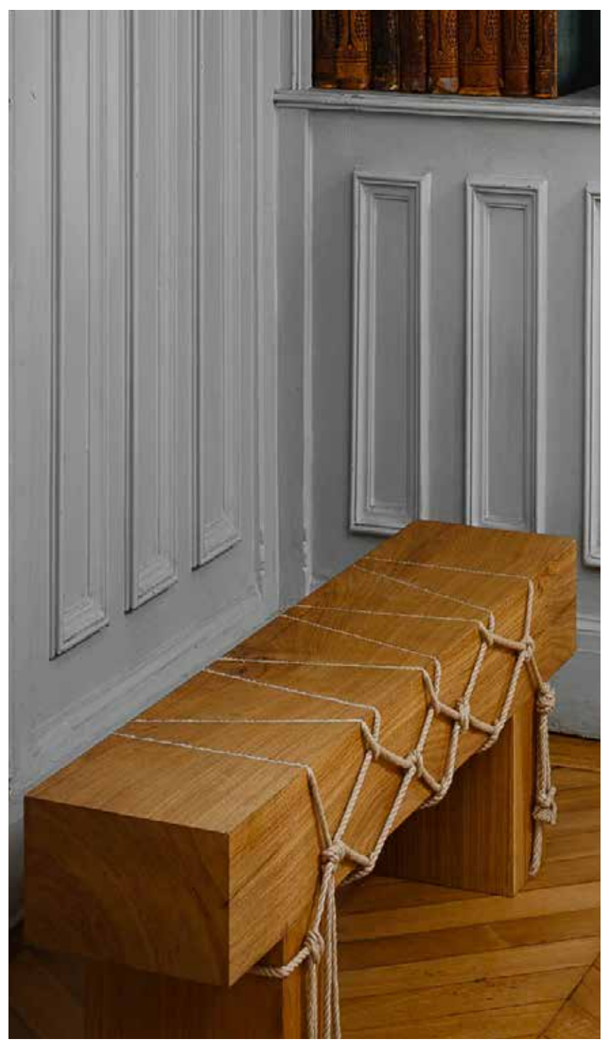
Installation view, Private Choice, Paris, France, 2023, © Theo Baulig