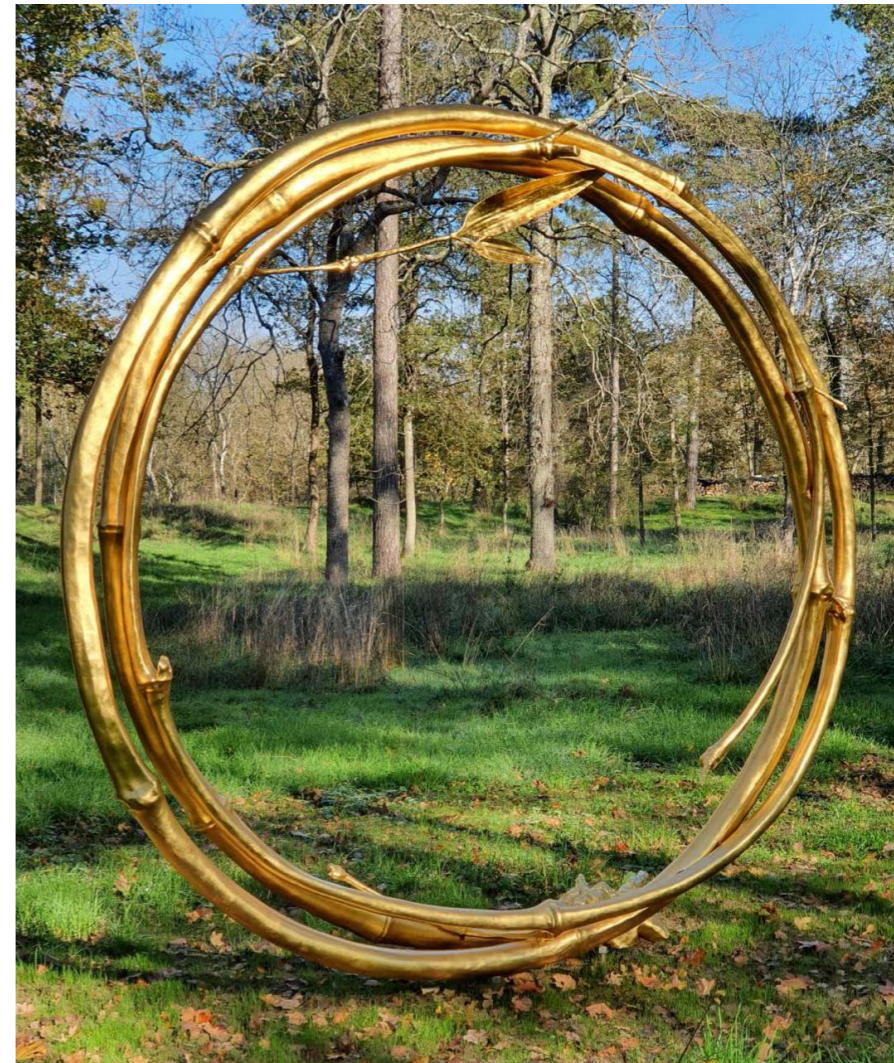
View of permanent installation, Château de la Haute Borde, Rilly-sur-Loire, France, 2020.