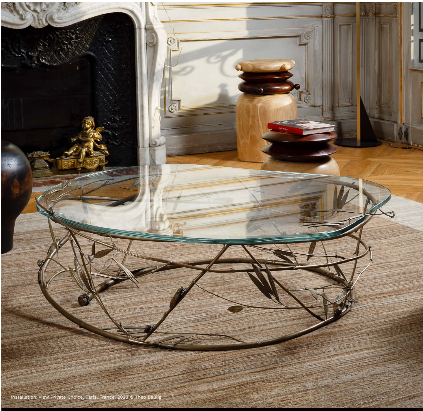
Installation, view Private Choice, Paris, France, 2023