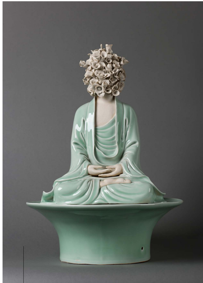
1. Zen meditation , 2014 Bisque ceramic. 45 x 30 x 30 cm / 18 x 12 x 12 in