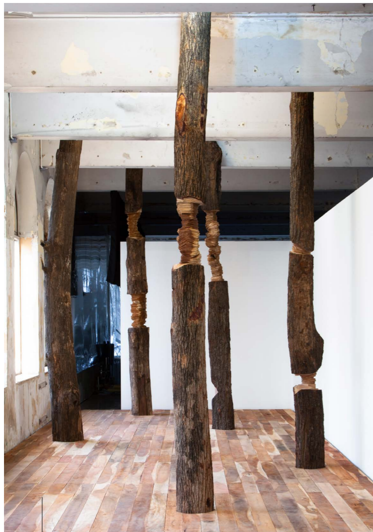
Installation view, Beyond Bliss, Biennale of Bangkok, 2018