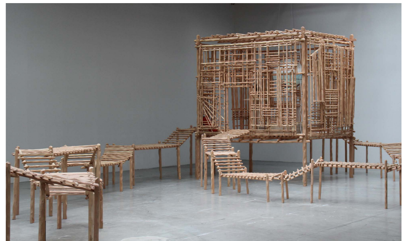
Exhibition view, Palais de Tokyo, Paris, France, 2016