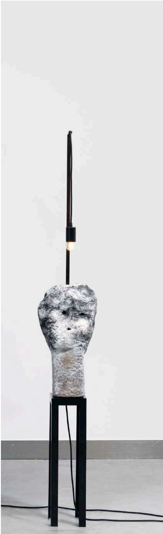
Installation view, French Design, Paris, France, 2022