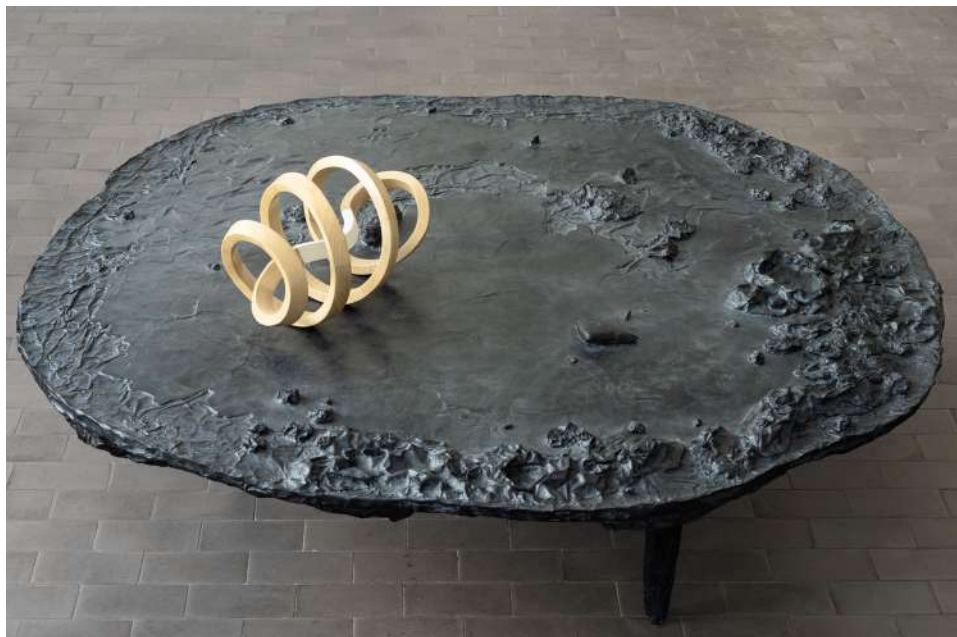
Installation view, LABÒ, Milano, Italy, 2023, © Lorenzo Palmieri