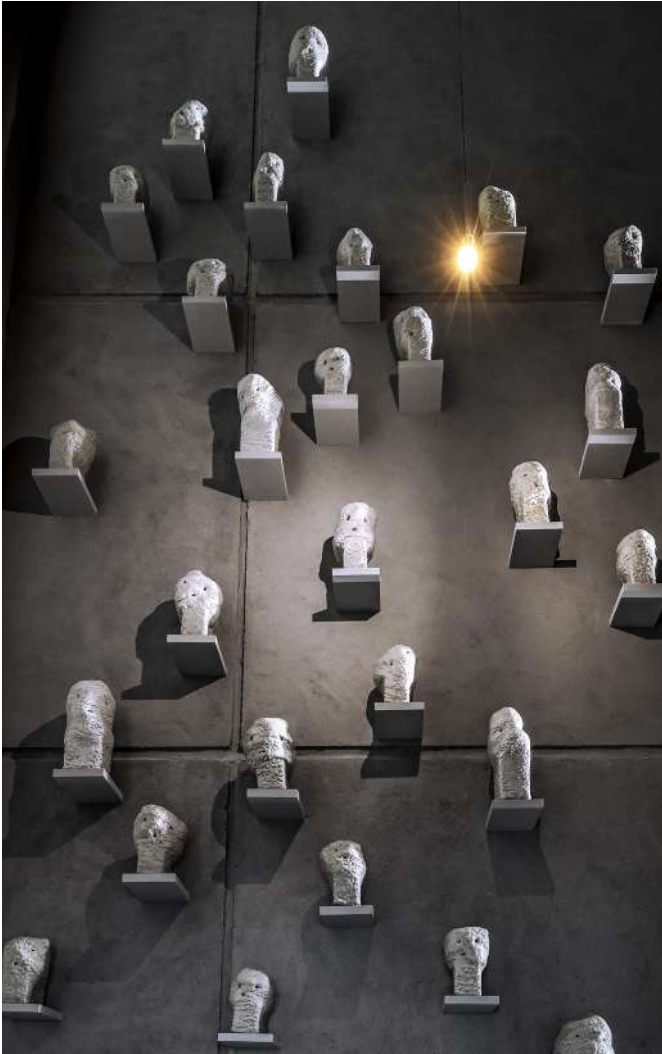
1. Exhibition view, Gallery Kewenig, Berlin, Germany, 2022