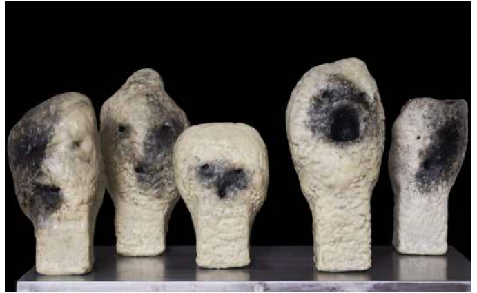
Exhibition view, Qui es-tu ? , Centrum Gietdowe, Varsovie, Poland, 2022