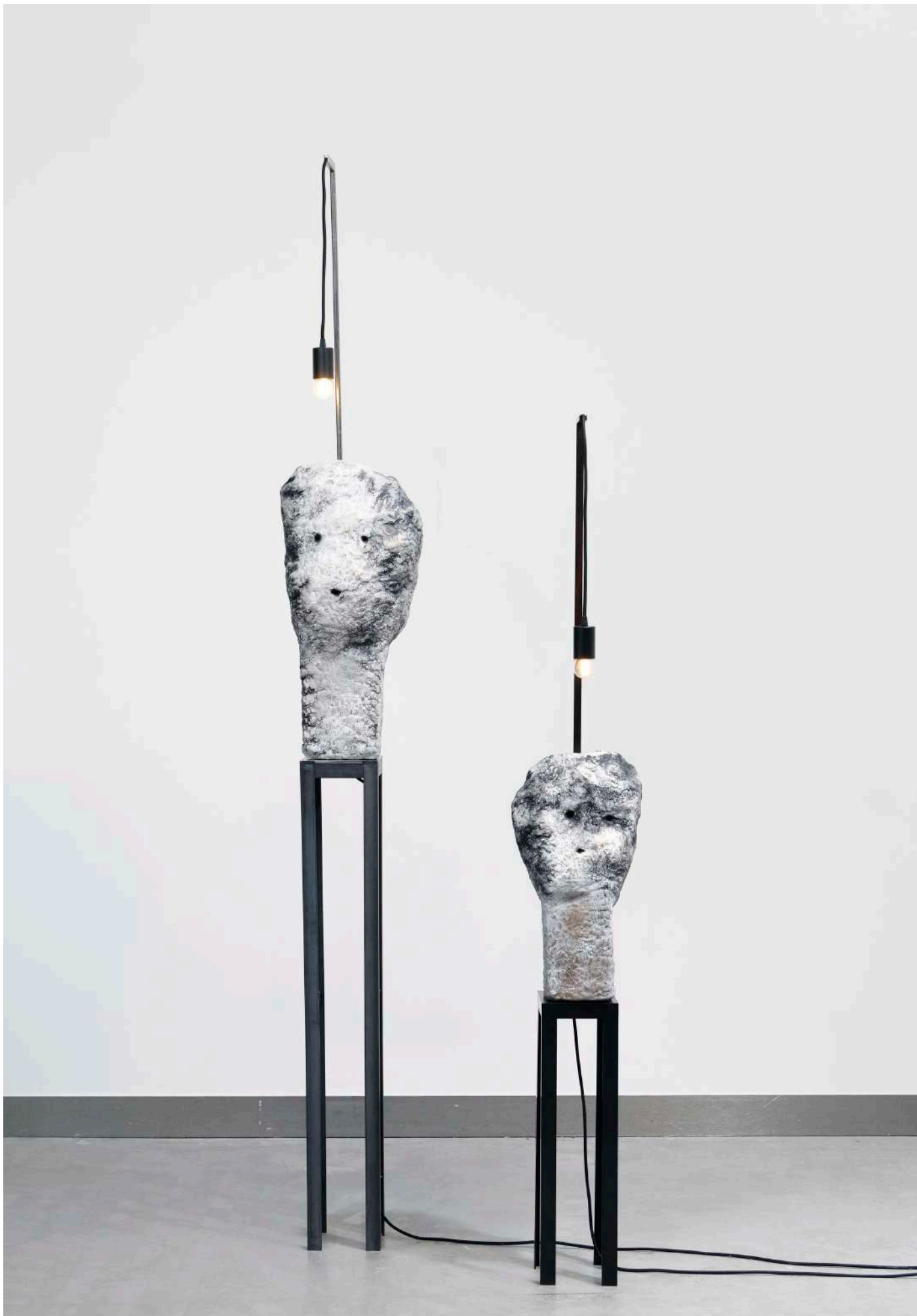
Installation view, French Design, Paris, France, 2022, © Aurélien Mole