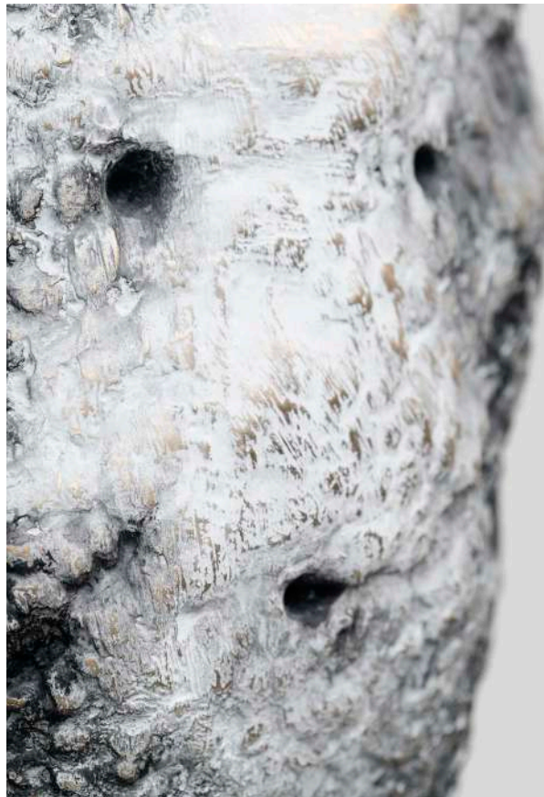
Installation view, French Design, Paris, France, 2022, © Aurélien Mole