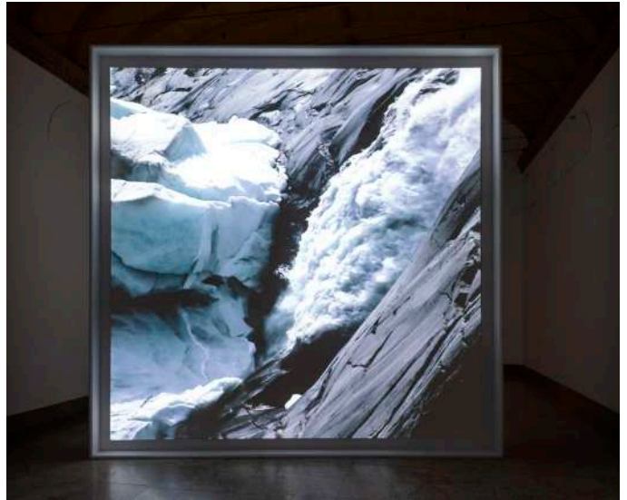
2. Exhibition view, La Formule du Temps , International Center of Art and Landscape at Vassivière, Vassivière, France, 2020

1. 7306 jours avec Liberté (Installation), 2021 35 wax sculptures, various dimension.