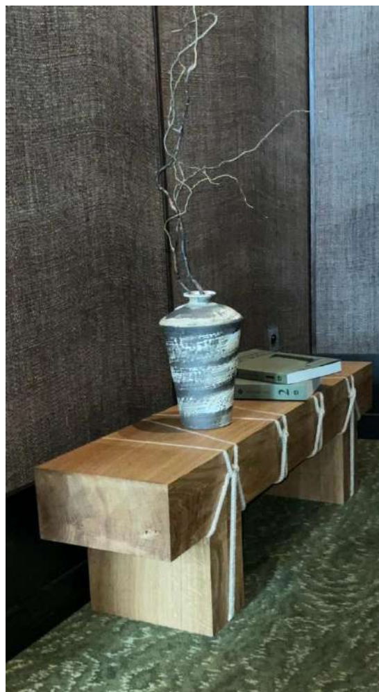
Installation view, Hotel Hana , Paris, France, 2024