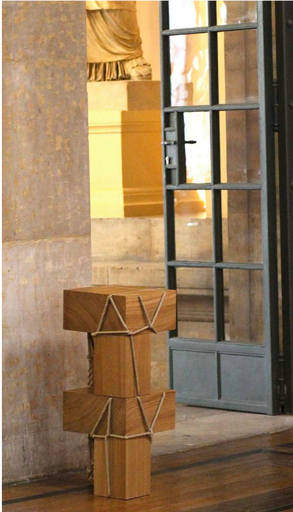
Installation view, Beaux-Arts de Paris, Paris, France, 2023, © Alice Randazzo