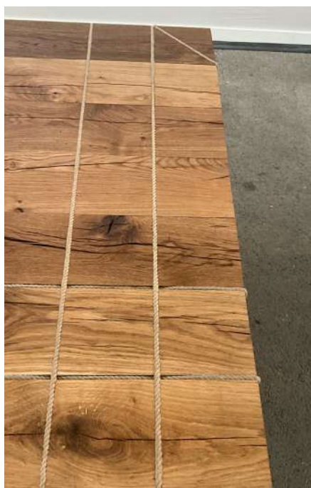
Installation view, Art Paris, Paris, France, 2024