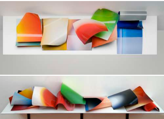
3. Installation view, Loevenbruck gallery, Paris, France, 2009

1. Dust devil (installation), 2016 Concrete, iron, glass, dust.