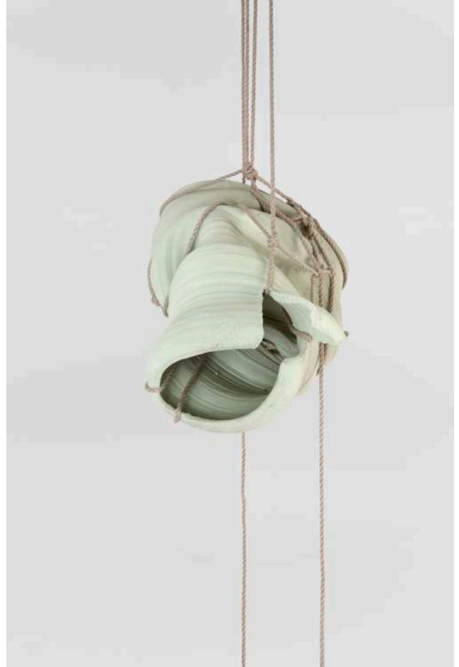
2. Installation view, Museum of Fine Arts, Dole, France, 2015