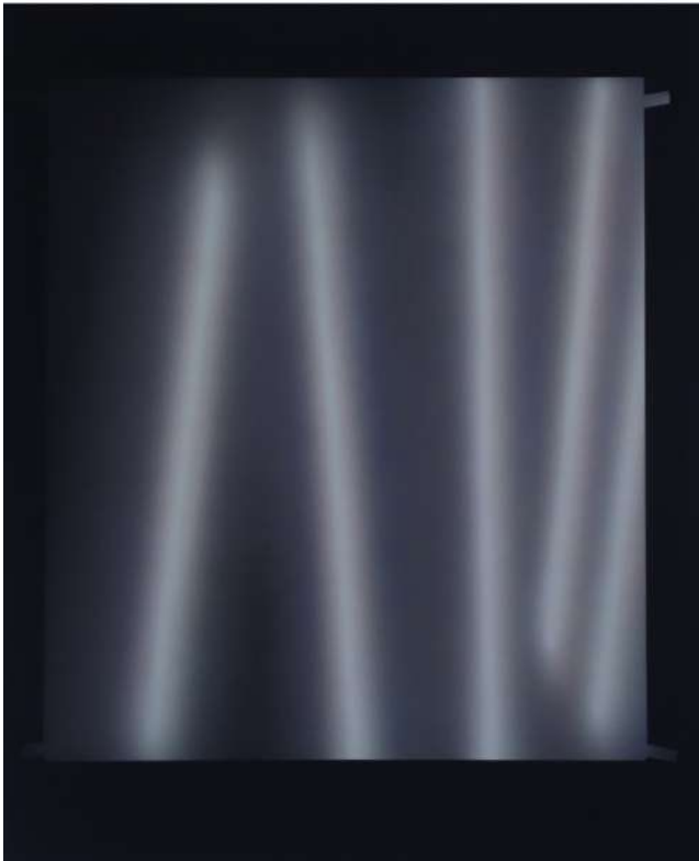
Put back, Dan 2 (painting), 2023 Acrylic on canvas, 80 x 100 cm