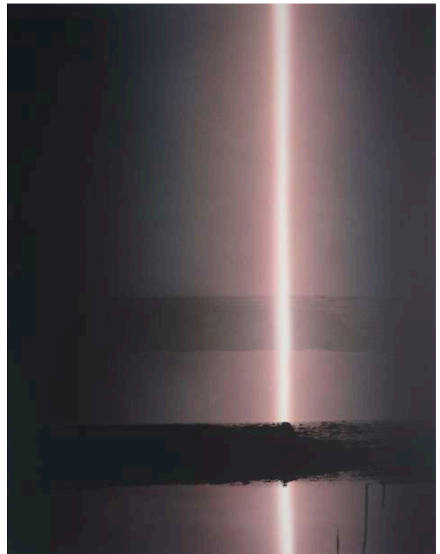
Dan évolution 7 (painting), 2023 Acrylic on canvas, 100 x 81 cm