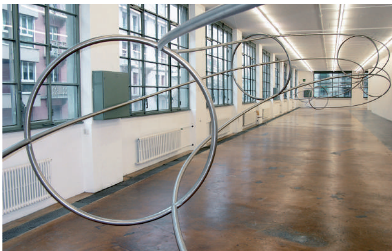
Scape , 2006. MAMCO, Geneva.