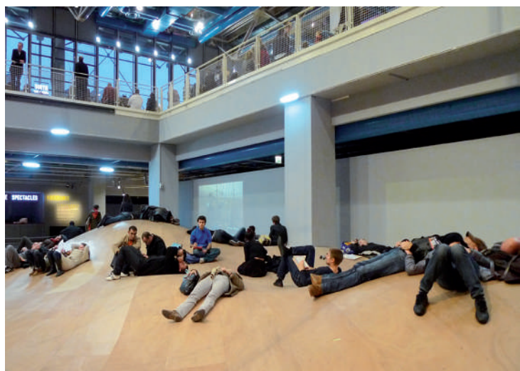
Sol.07 , 2009. Center Georges Pompidou, Paris.