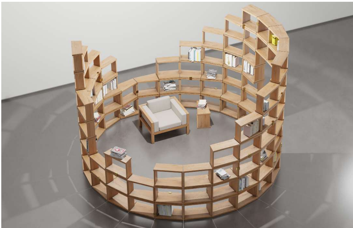
Orbis 4.2 , 2023

Orbis 4.2 , 420 cm in diameter. The artist is offering a sculpture library with a minimum of 12 modules, to which additional modules can be added even after the purchase. A complete tower requires 168 modules (maximum height 319 cm).