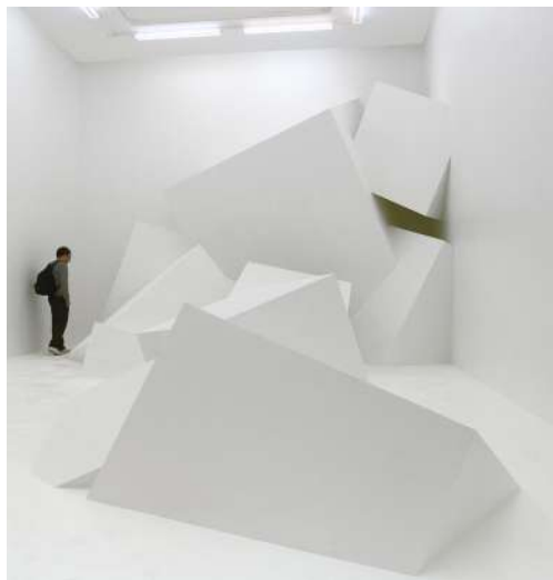
AR.07 , 2008. Institute of Contemporary Art, Villeurbanne.