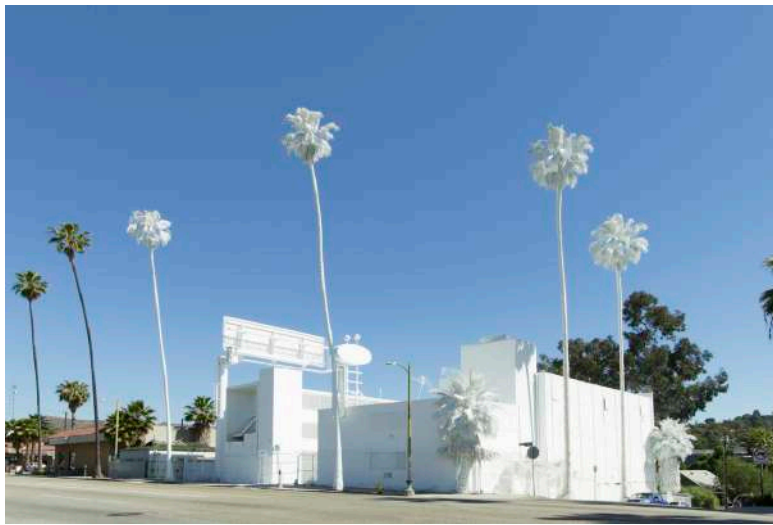
Projection (Sunset Pacific Motel) , 2015. 4311 W Sunset Boulevard, Los Angeles.