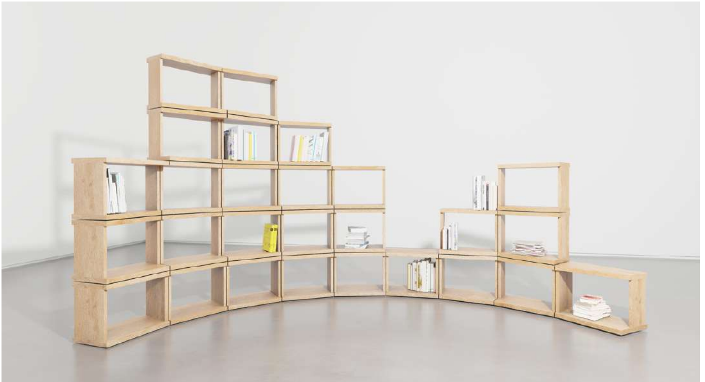
Orbis 4.2, 2023, 27 modules laid out.