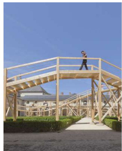
Belvedere(s) , 2012. The Royal Abbey of Fontevraud.