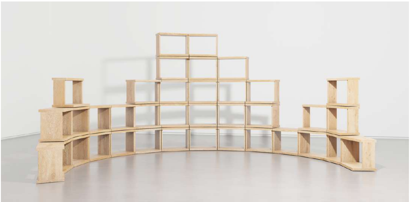
Orbis 4.2, 2023, 37 modules laid out.