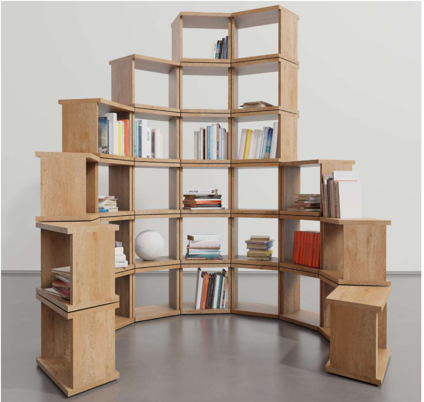
Orbis 2.1 , 2023

Orbis 2.1 , with a diameter of 210 cm. The artist proposes a library-sculpture with a minimum of 6 modules, to which additional modules can be added even after its purchase. A complete tower requires 60 modules (maximum height 319 cm).