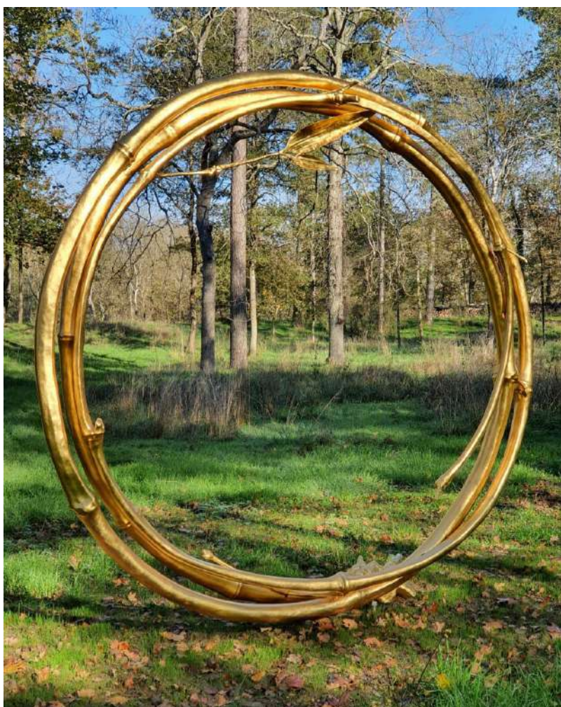
Permanent installation view, Haute Borde Castle, Rilly-sur-Loire, France, 2020