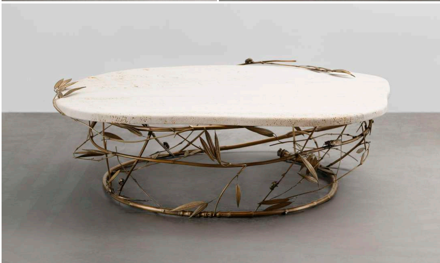
Installation view, French Design, Paris, France, 2022, © Aurélien Mole