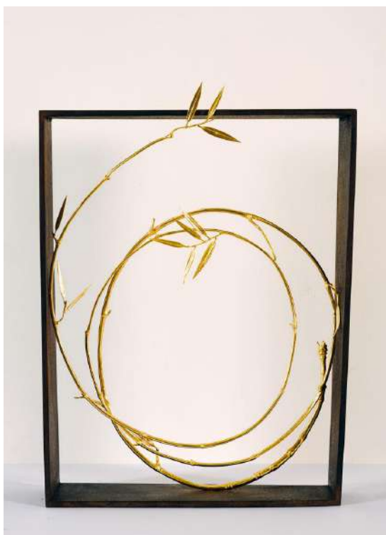
Voie d'or (sculpture), 2022 Golden bronze, 62 x 47,5 cm. Edited in 8 examples.