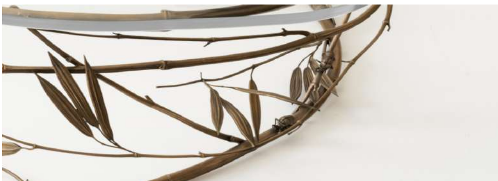
Installation view, LABÒ, Milano, Italy, 2023